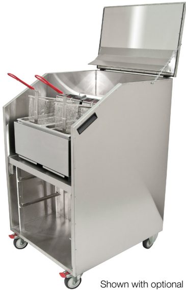
Shown with optional Fryer