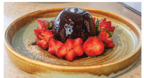
Even cooking and heating results