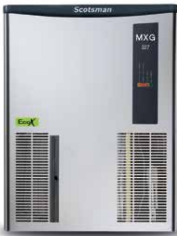
Medium gourmet cube 20g, 30mm dia x H 34mm