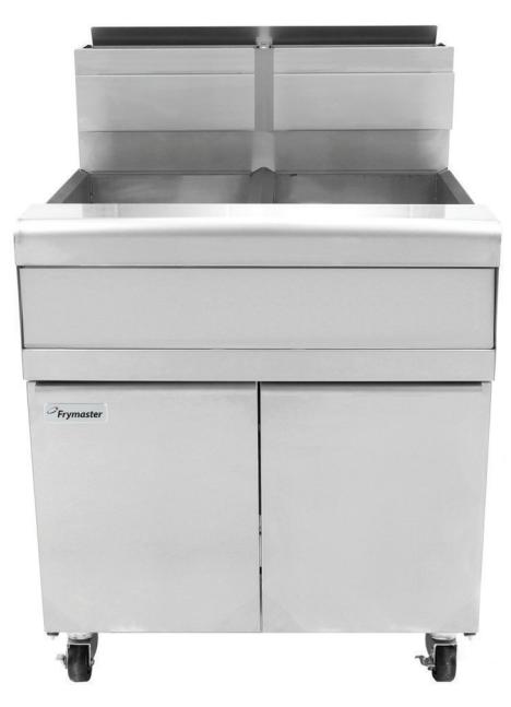
shown with optional castors