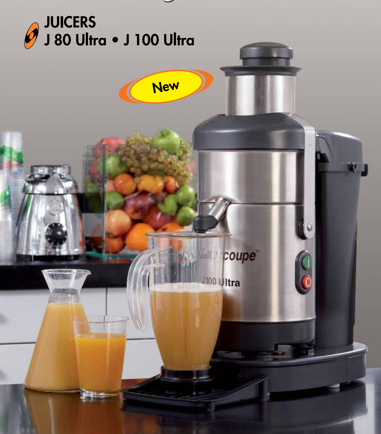
BARS - TAKEAWAY OUTLETS - RESTAURANTS - HOTELS - CANTEENS