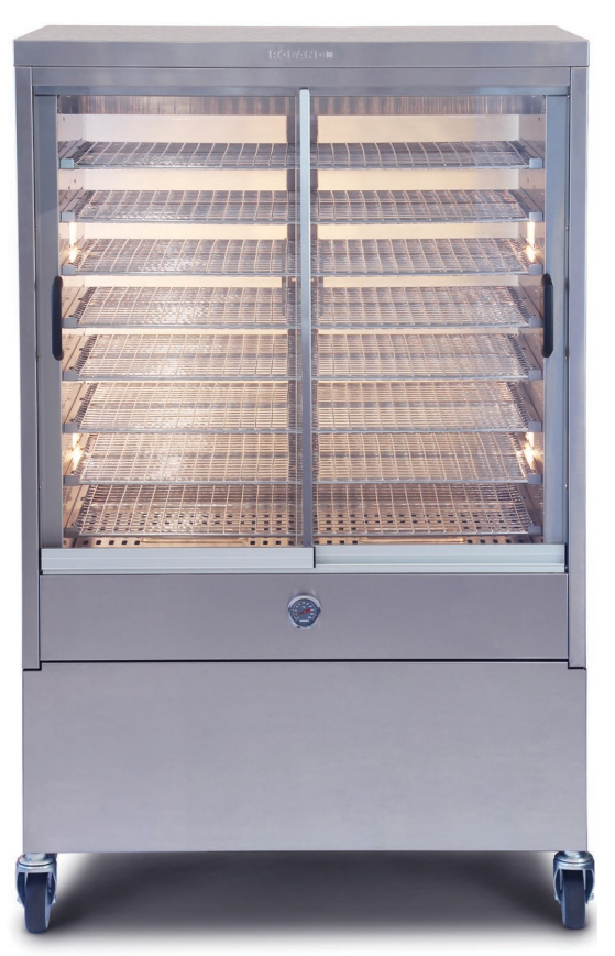
Optional HT200 Trolley for ease of placement