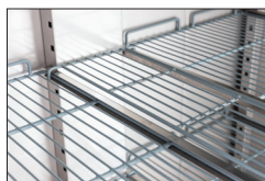
Bridge between shelves for maximum use of space