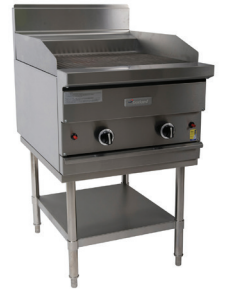
GF24-BRL pictured on MS-G24B Stand

Cast-iron burners for every 152mm section and heavy duty ceramic briquettes sitting on horizontal bars distribute heat evenly. Protected individual pilot lights, piezo spark ignition and flame failure as standard. Large 584mm deep removable dual sided broiling grates (13mm rounded bar or diamond fine pattern). Exclusive lift-off hopper. Comes with Set of 4 legs for countertop mounting. Large easy-to-use hi-lo control knobs sit flush to the 'plate rail' and the unit can sit on top of the optional stainless steel stand with storage shelf.