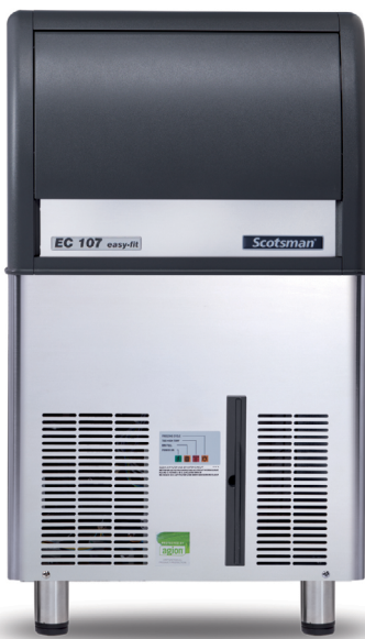
Medium gourmet cube 20g, 30mm dia x H 34mm