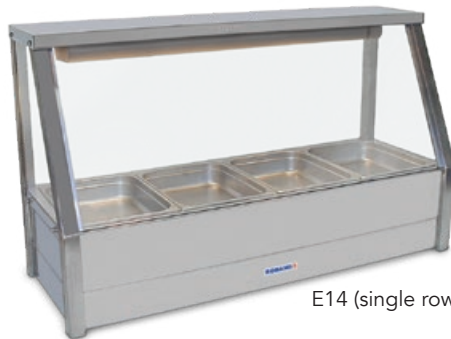
E14 (single row)