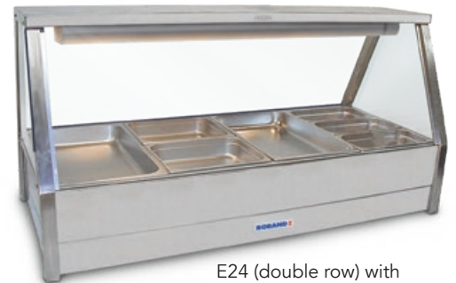
E24 (double row) with various sizes of pans

^ Machines should not be left unattended. See pages 50 - 52 for all optional accessories.