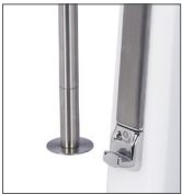
Universal Lower Disk