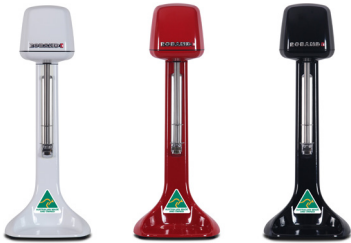
DM31W DM31R DM31B

Roband milkshake mixers are designed for making perfect thickshakes or milkshakes every time. With a removable easy-to-clean cup support and sturdy wipe-to-clean machine base. Fitted with a Saturn beater for extra fluffy shakes, but also supplied with two alternative beaters so establishments can configure the mixer to best suit their drink menu.