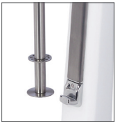
Universal Upper & Lower Disks