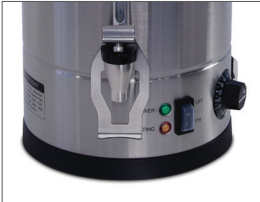
Optional HF1 - hands free tap lever (shown on UDS10VP urn)