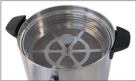
The patented “safety dome” ensures great tasting coffee while also reducing the risk of scalding