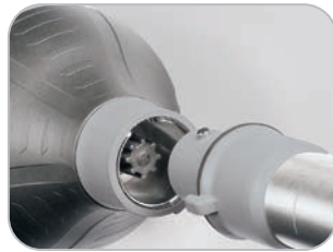
Quick tool assembly