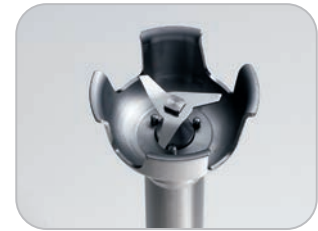
Bell and knives of stainless steel