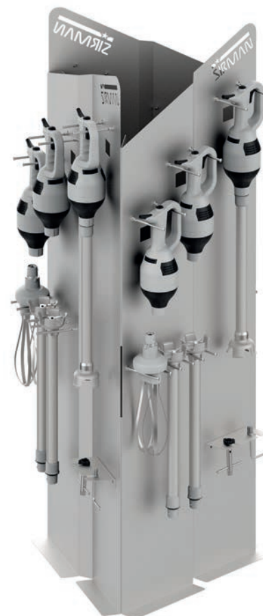
Self-supporting structure with 3 display stands