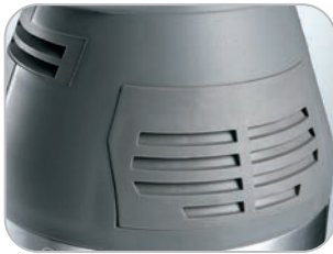
Air intake IP x3