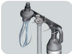
Optional wall support