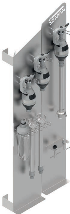
VORTEX/CICLONE Optional display stand