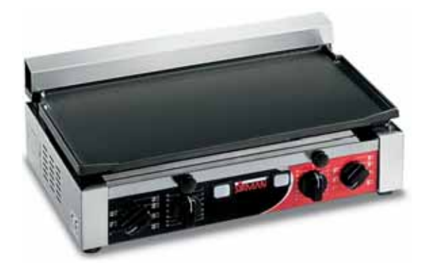
TOP LL TIMER