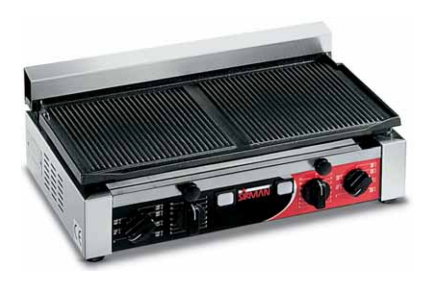
TOP RR TIMER